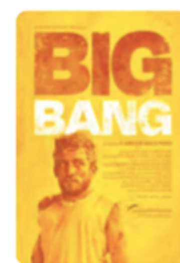
Big Bang Carlos Segundo