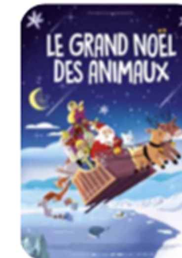
Le grand Noël des animaux Collectif de six réalisatrices